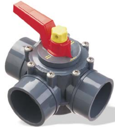
3 PORT MODEL