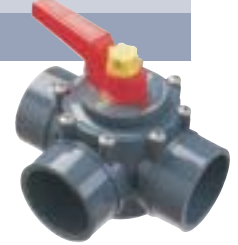
3 way traditional