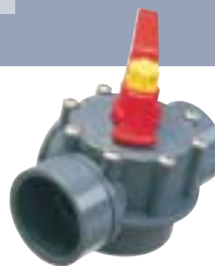
2 way straight