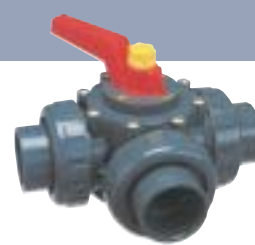
3 way unionized