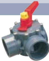
2 way 90°